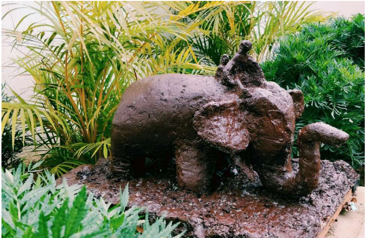
The grand elephant with a Mahaout seated on it was created during the workshop and children enjoyed it thoroughly.