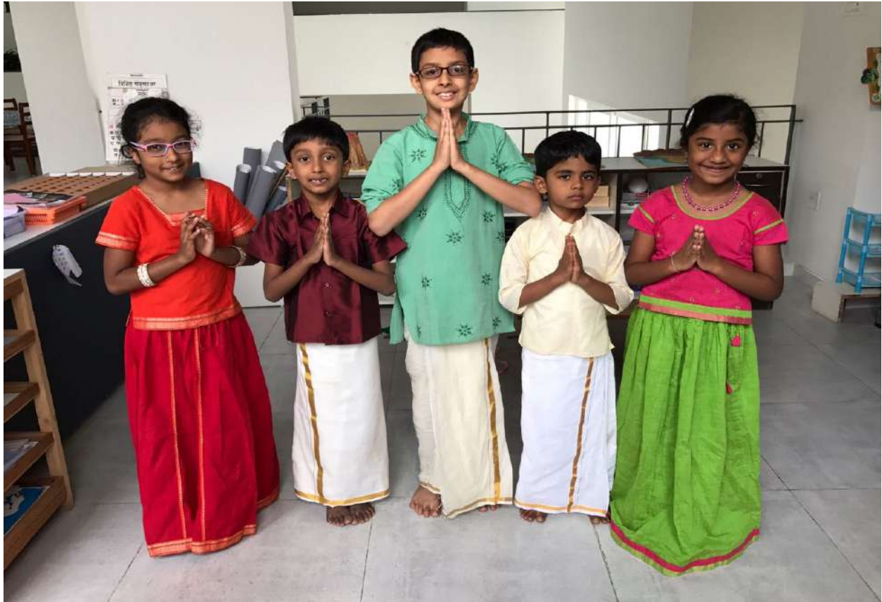
Dressed in traditional attire children looked so welcoming and excited for yet another celebration ' Onam and Rakshabandhan ' special.